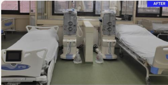
Remodeling of the hemodialysis ward at the Užice hospital

Balkan Corruption Watch Project Student Leadership Forum Kosovo Children's Holiday Gifts Project Balkan Medical Aid Project-SAMA