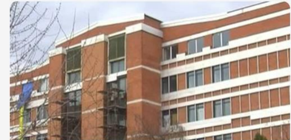
Patients in Pirot now have comfortable and clean hospital beds.