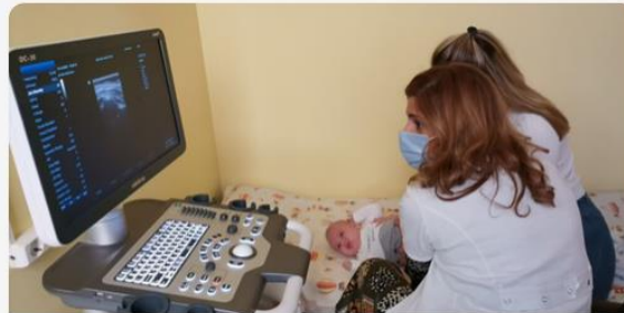
Children's Health Center in Loznica now has an ultrasound and a sterilizator

Trebinje, Republika Srpska, Bosnia and Herzegovina