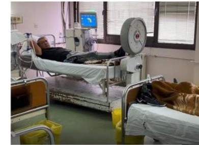
Ivanjica has a new health clinic