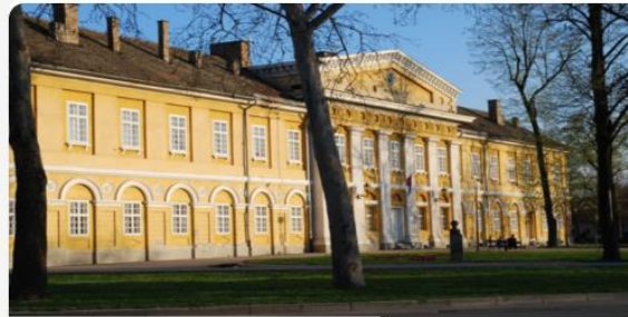
Pancevo Urgent Center